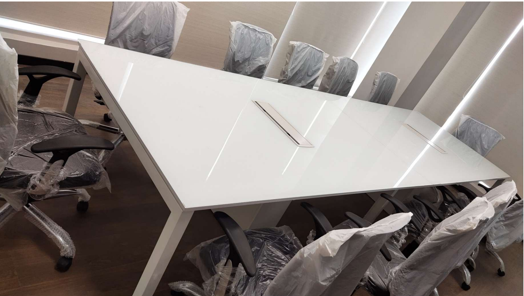
Meeting Tables & Conference Tables