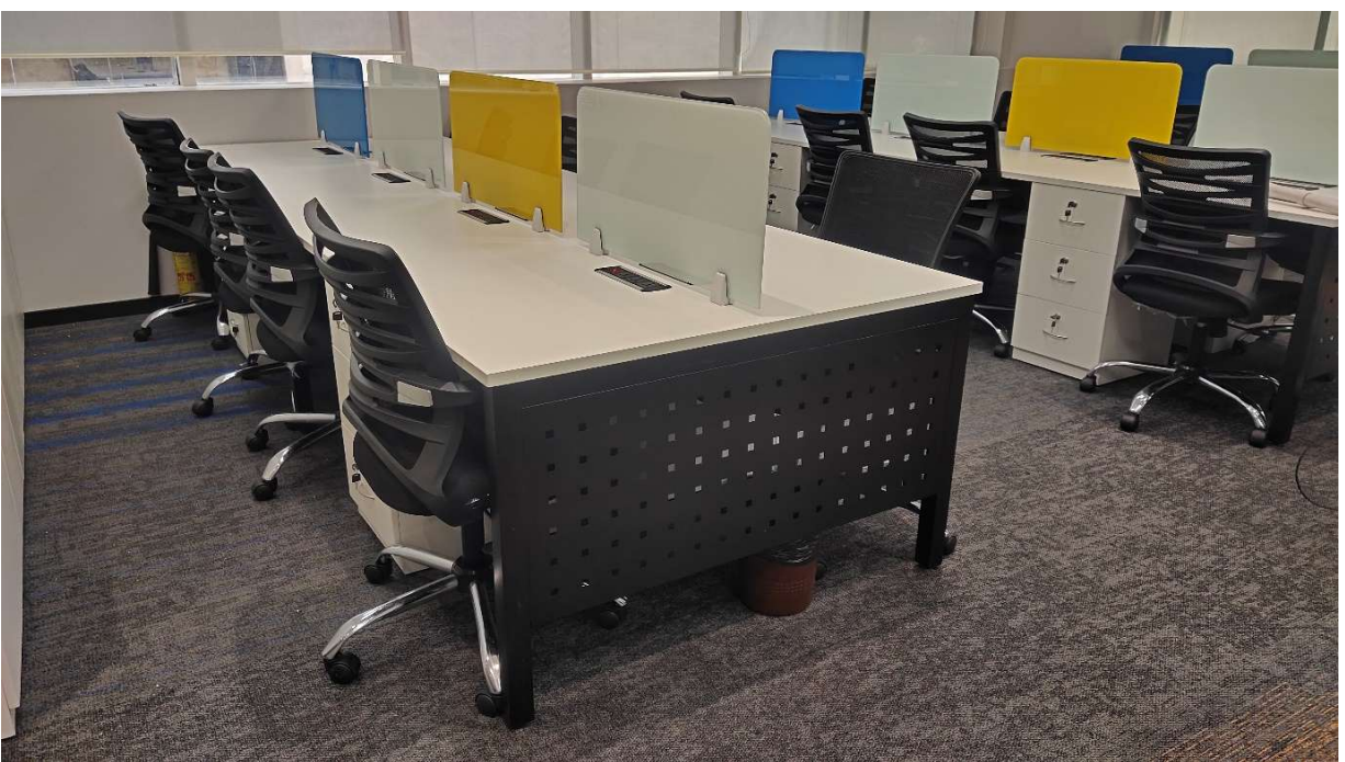
Desking Systems - Images